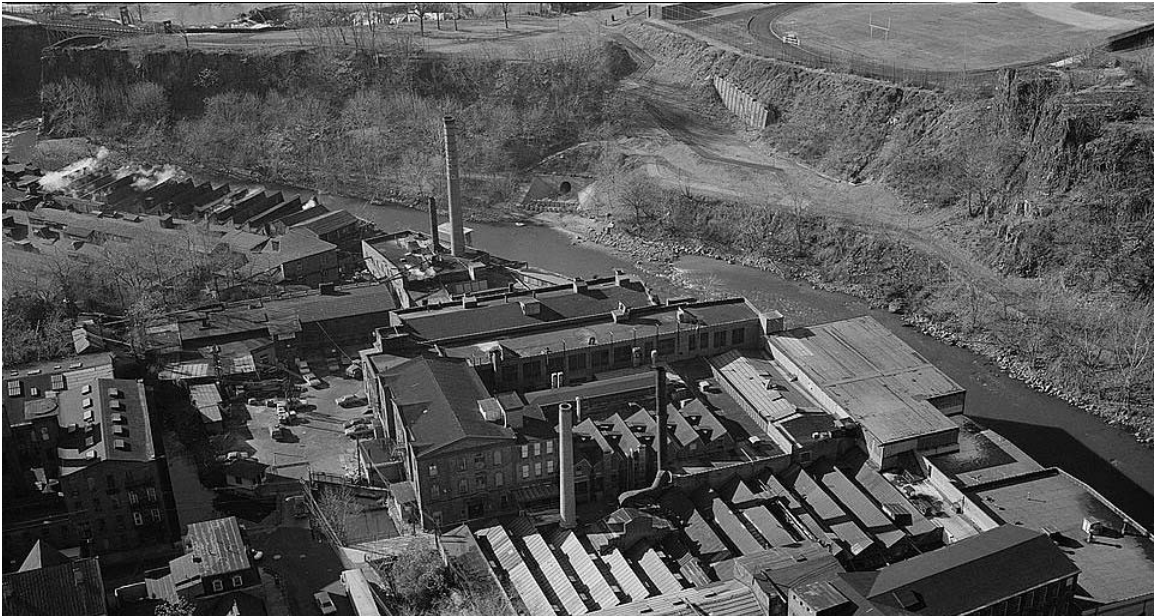
Photo 7 – 1973 HAER aerial photograph of ATP site looking southwest