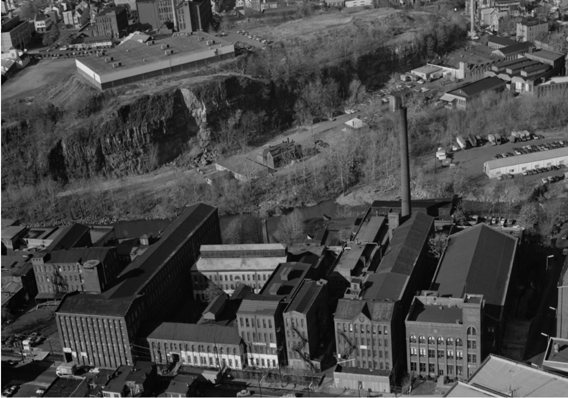
Photo 6 – 1973 HAER aerial photograph ATP site and the lower raceway looking northwest