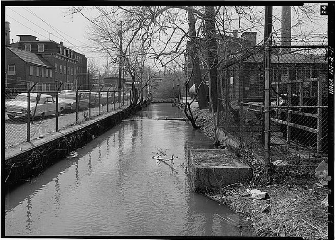
Photo 5 – 1973 HAER photograph of the lower raceway at the ATP site