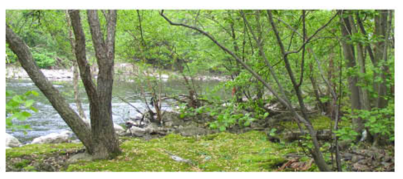
Eastern riverbank at ATP site