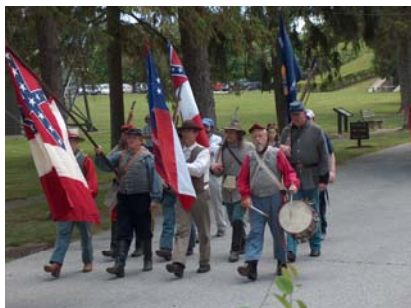
A group of Civil War re-enactors march to Finns Point National Cemetery to hold a small ceremony.