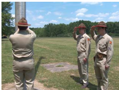
Members of Fort Mott's staff raise the flag to full staff at noon.