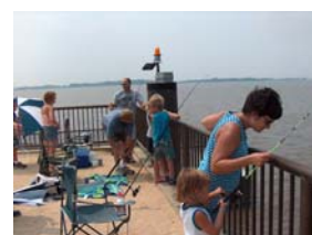
With some help, a young lady casts her line into the river.