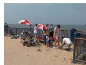
Despite the heat, many families come out