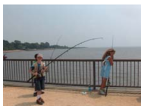
A young angler bringing a fish to be measured.