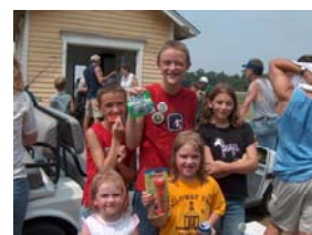
The Derby's Winners Circle showing their prizes