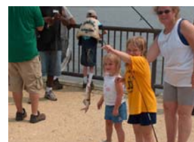
A young fisherman displaying his catch.