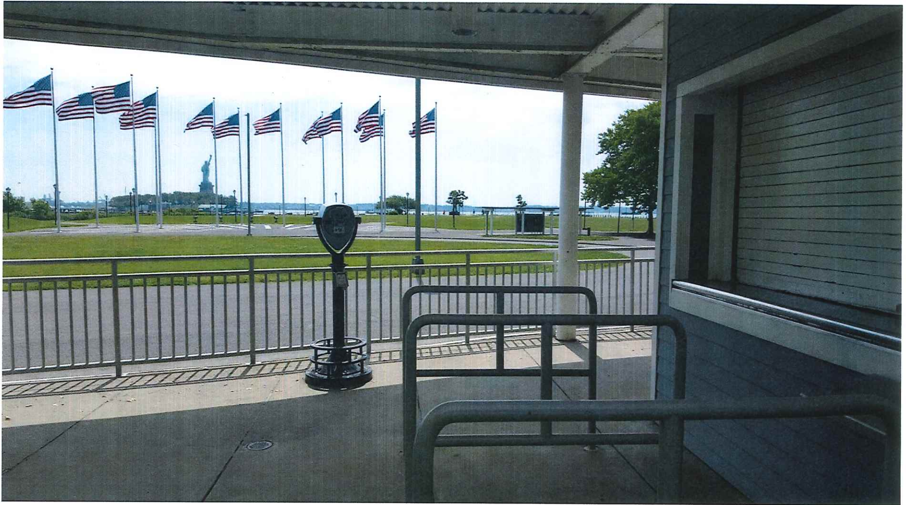
View looking East of Concession Stand