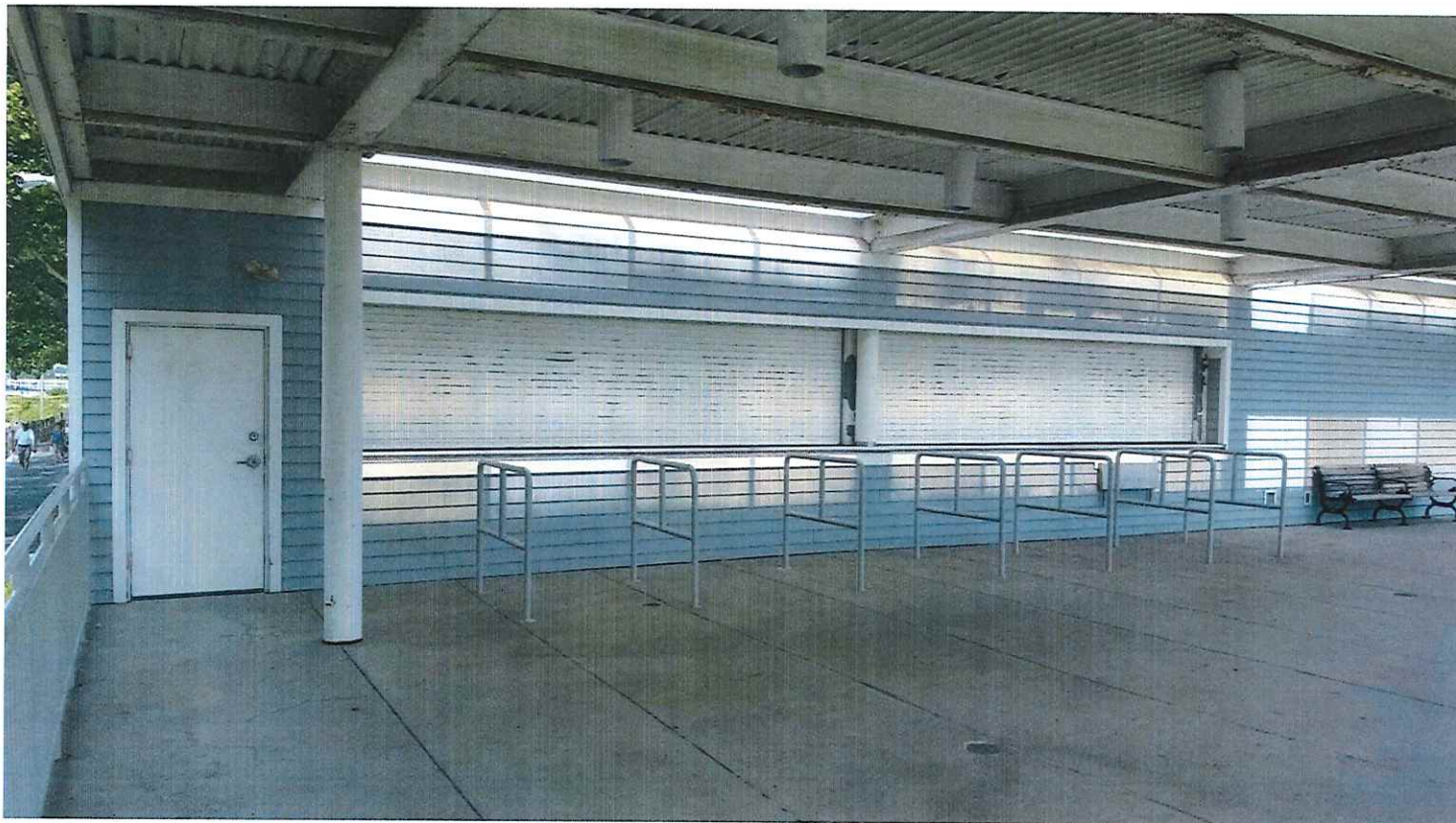
View of front of Concession Stand